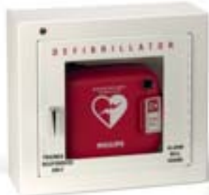
Basic Surface Mounted Cabinet

Dimensions: 16.5 x 15 x 6 in (42 x 38 x 15 cm) W x H x D Weight: 11.9 lbs (5.4 kg)