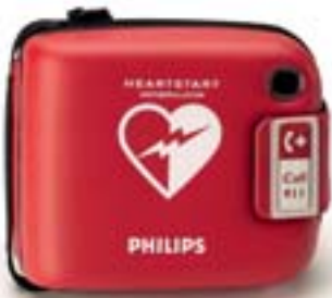
Standard Carrying Case